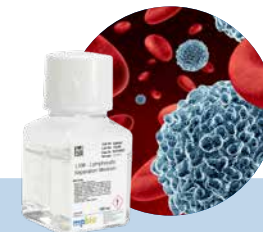
Lymphocyte Separation Medium