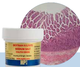
DSS for IBD/Colitis Research