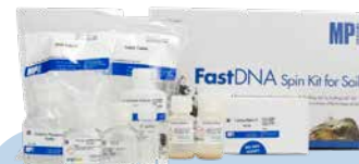
FastDNA™ SPIN Kit for Soil