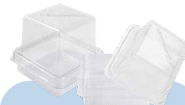
PlantCon™ Plant Tissue Culture Containers