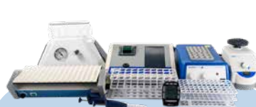
SafTest™ System for Food Quality Testing