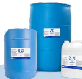
7X® Laboratory Cleaning Solutions