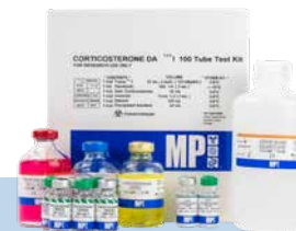
Corticosterone Double Antibody RIA Kit