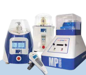
FastPrep® Bead Beating Homogenization Systems