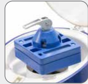
Large Sample Volume